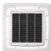
Cover PB-950HE4 (option)